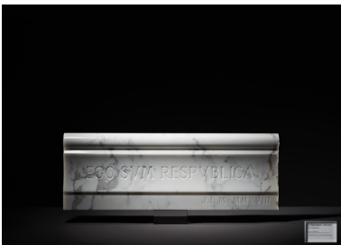
Title : La République, c'est moi! , 2023 Technique : Marbre Calacatta crème Size : 27x75x3,5 cm Price TTC : 2.500,00€

Marine Le Pen Nord-Pas-de-Calais Regional Councilor (2010-2015), Member of the European Parliament (2004-2017). FN, RN March 8, 2012. LEPOINT.FR.