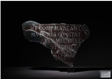
Title : Le progrès consiste à faire que les femmes restent à la maison , 2023 Technique : Marbre violet Fantasy Size : 49x72x2 cm Price TTC : 3.000,00€

Emmanuel Macron 25th President of the French Republic (2017-2012, 2nd term in progress), Minister of the Economy, Managing Partner of the Rothschild & Co. PS business bank, LREM September 15, 2018. BFMTV