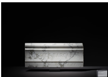
Title : Casse-toi pau'con , 2023 Technique : Marbre Calacatta crème Size : 27x64x3,5 cm Price TTC : 2.300,00€

Jean-Luc Mélenchon MP LFI (2017-2022), Member of the European Parliament (2000-2017). BIA October 16, 2018. TMC. During the tumultuous searches at the headquarters of the party of La France Insoumise by the Anti-Corruption Office.