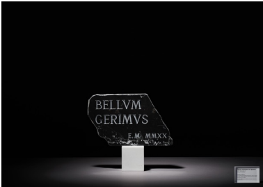
Title : Nous sommes en guerre , 2023 Technique : Marbre noir précieux Size : 34x38x2 cm – Socle 11x10x11 cm Price TTC : 2.500,00€

Benjamin Grivaux Government Spokesperson (2017-2020), French Member of Parliament (2019-2021). LREM November 17, 2019. LE FIGARO