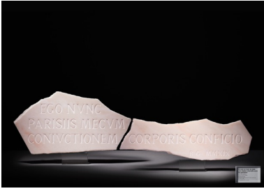
Title : Moi je suis sentrain de bâtir une relation charnelle avec les parisiens , 2023 Technique : Pink marble from Portugal Size : 18x58x2 cm – 27x52x2 cm Price TTC : 3.200,00€

Benjamin Grivaux Government Spokesperson (2017-2020), French Member of Parliament (2019-2021). LREM November 17, 2019. LE FIGARO